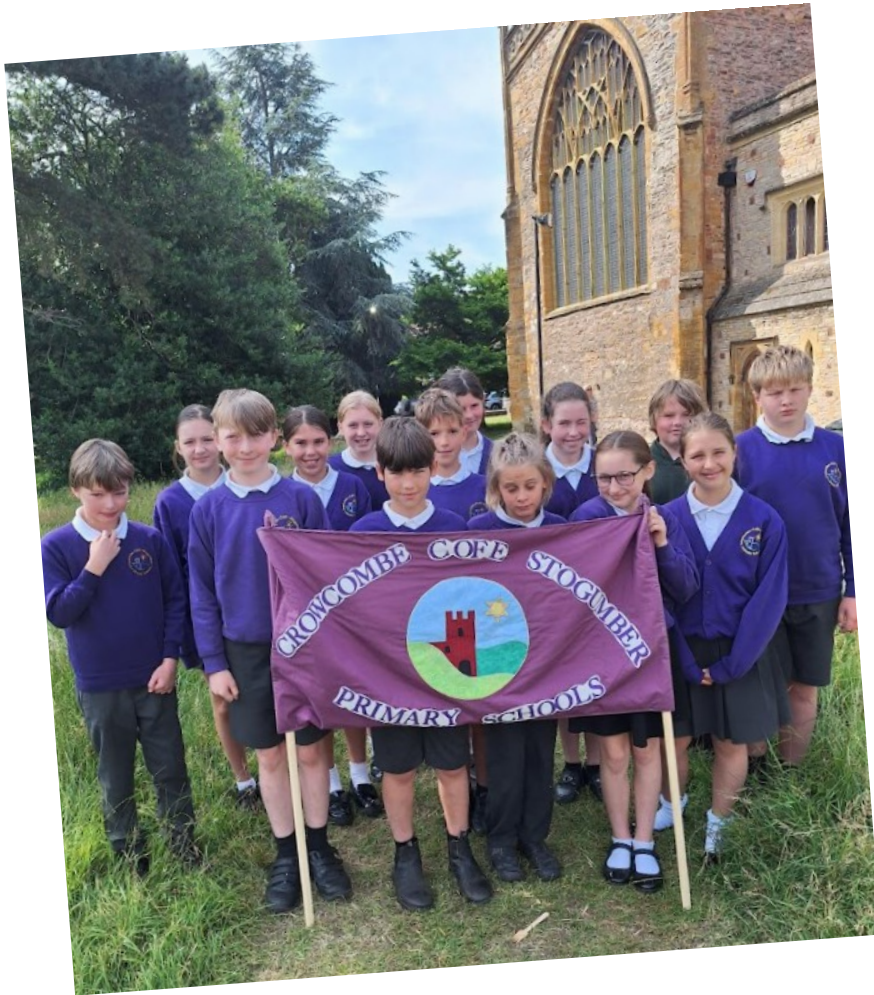
Year 6 attended a Leavers Service at Taunton Minster with other local school leavers