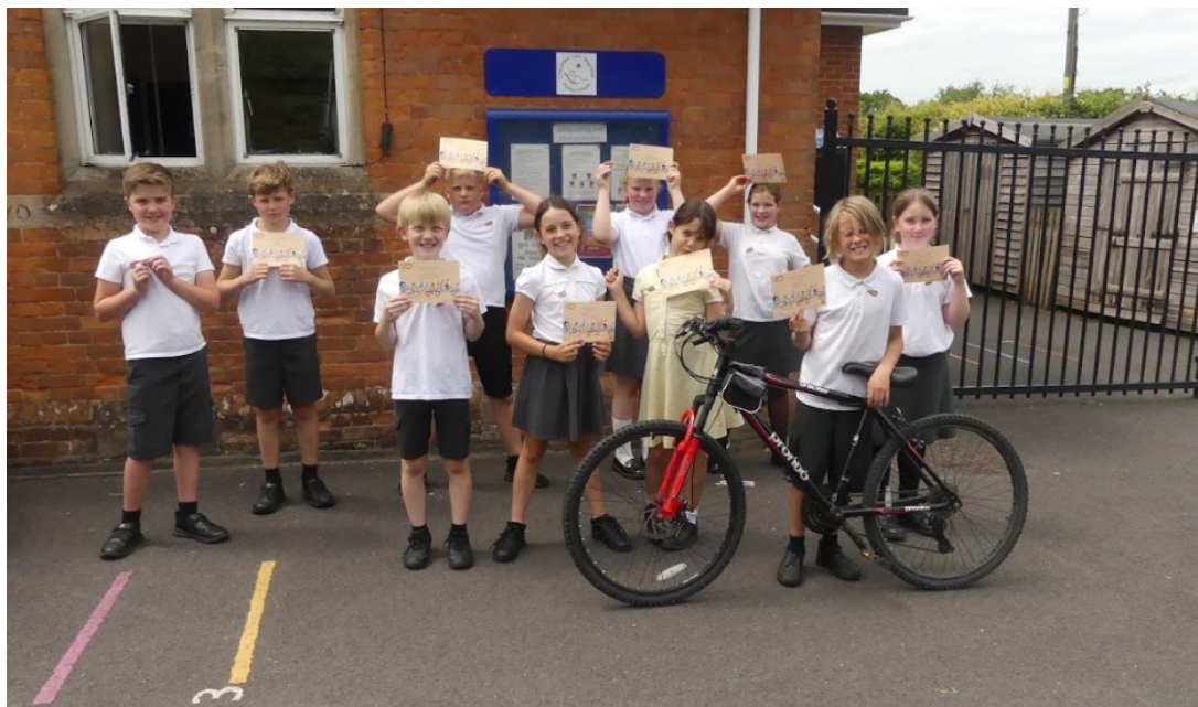
Year 5 passed their Bikeability with flying colours - well done!